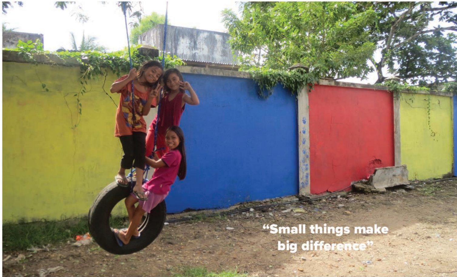
“Small things make big difference”